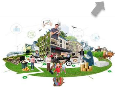
Positive Energy Districts and Neighbourhoods transforming the urban energy system