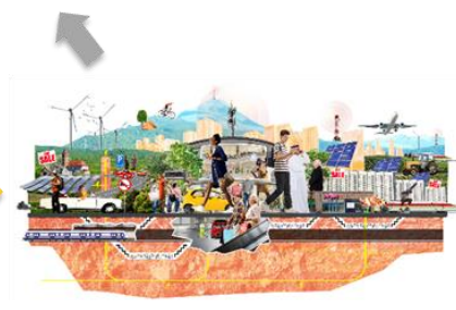
The 15 Minutes Cities rethinking the urban mobility system and space