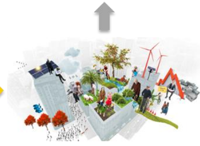
Downsizing District Doughnuts an integrated approach for urban greening and circularity transitions