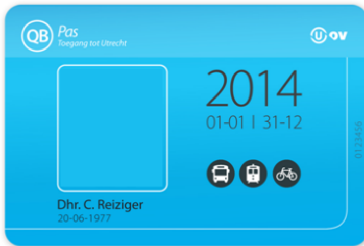
FIGURE 2: THE UTRECHT BEREIKBAAR PASS.

to keep the city accessible during road construction, the measures applied have a much broader scope and objective. An important element of the Utrecht Bereikbaar is the Utrecht Bereikbaar Pass, a card that provides access to bus, tram, train, public bicycles, internet hotspots, express coaches and Park and Ride facilities. The Utrecht Bereikbaar Pass is implemented in close cooperation with large companies located in the metropolitan area.