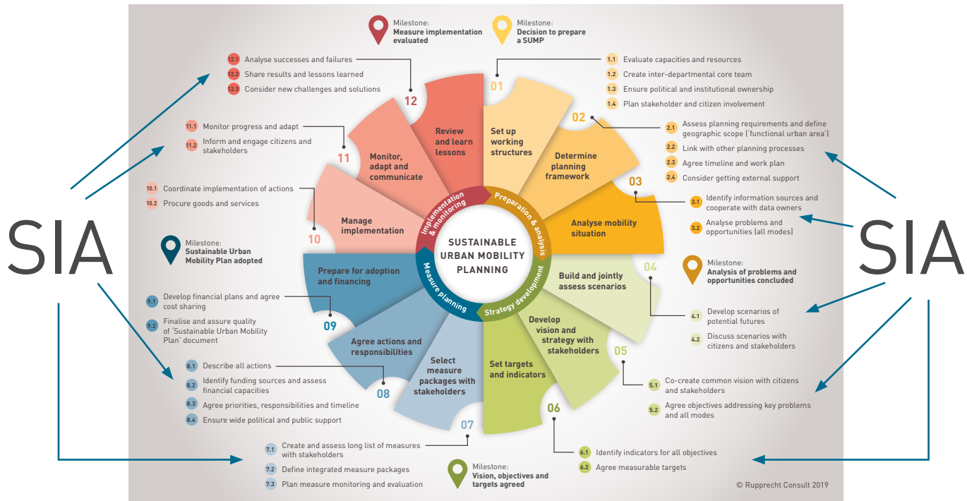
Figure 2: SIA in the SUMP planning cycle

SIA is predicated on the notion that decision makers should fully understand the likely consequences of their decisions before they act, and that people likely to be affected should be notified and have an opportunity to participate in the design of their future urban planning (IOCPGSIA 2003:248). The benefits of conducting a SIA include identifying affected groups, allaying fears and winning trust, avoiding adverse impacts whilst at the same time enhancing positive impacts such as reducing costs, getting faster approval from city authorities and stakeholders.