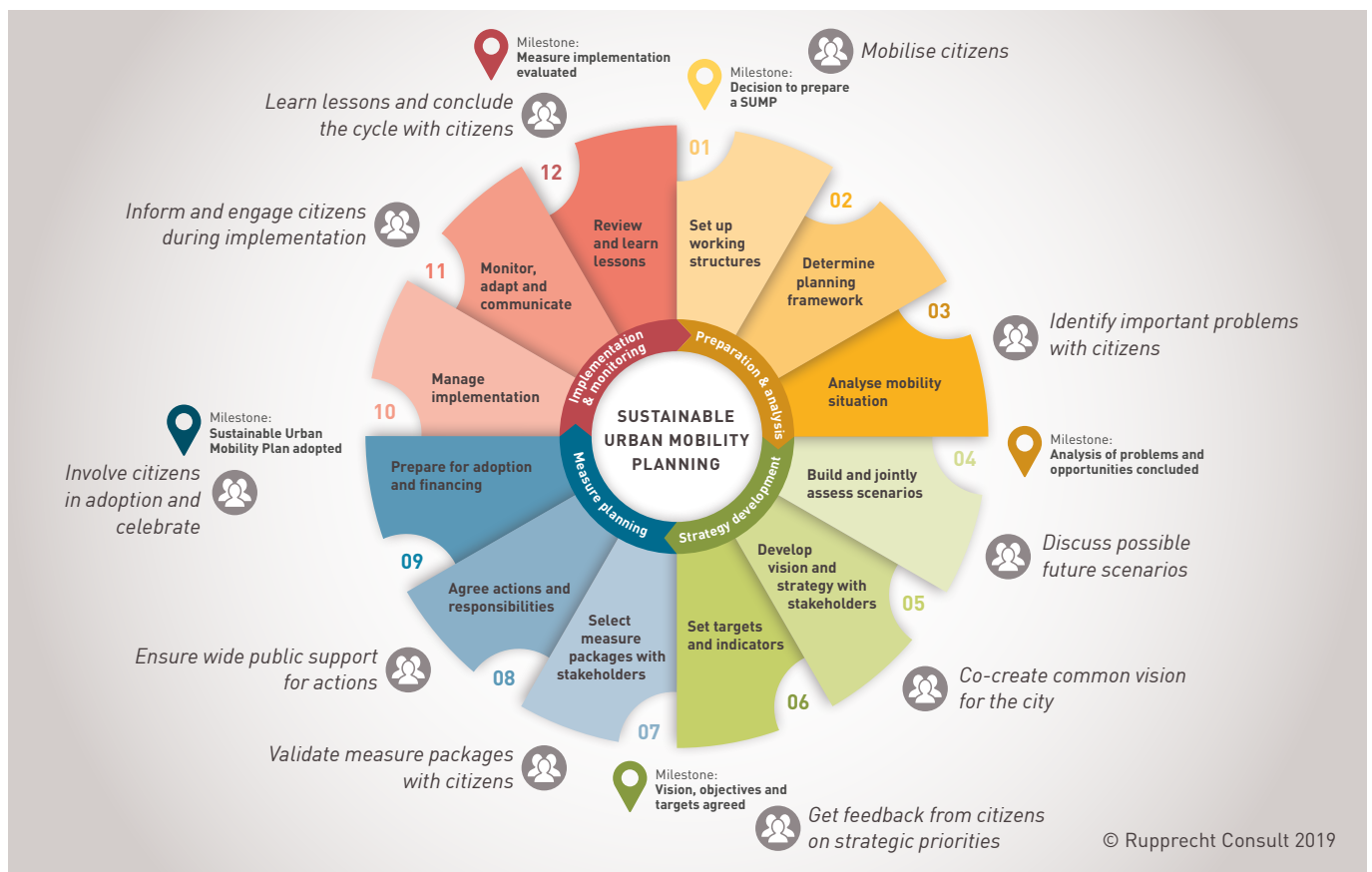
Figure 4: Citizen involvement in the SUMP process [p46 Sump Guidelines]

Typical qualitative methods include; key informant Interviews, focus group discussions, journey diaries and public hearings. Figure 5 illustrates a variety of methods used in the SUMP process. They are shown in terms of the level of user engagement they enable, from informing through to consulting, collaboration and empowerment.