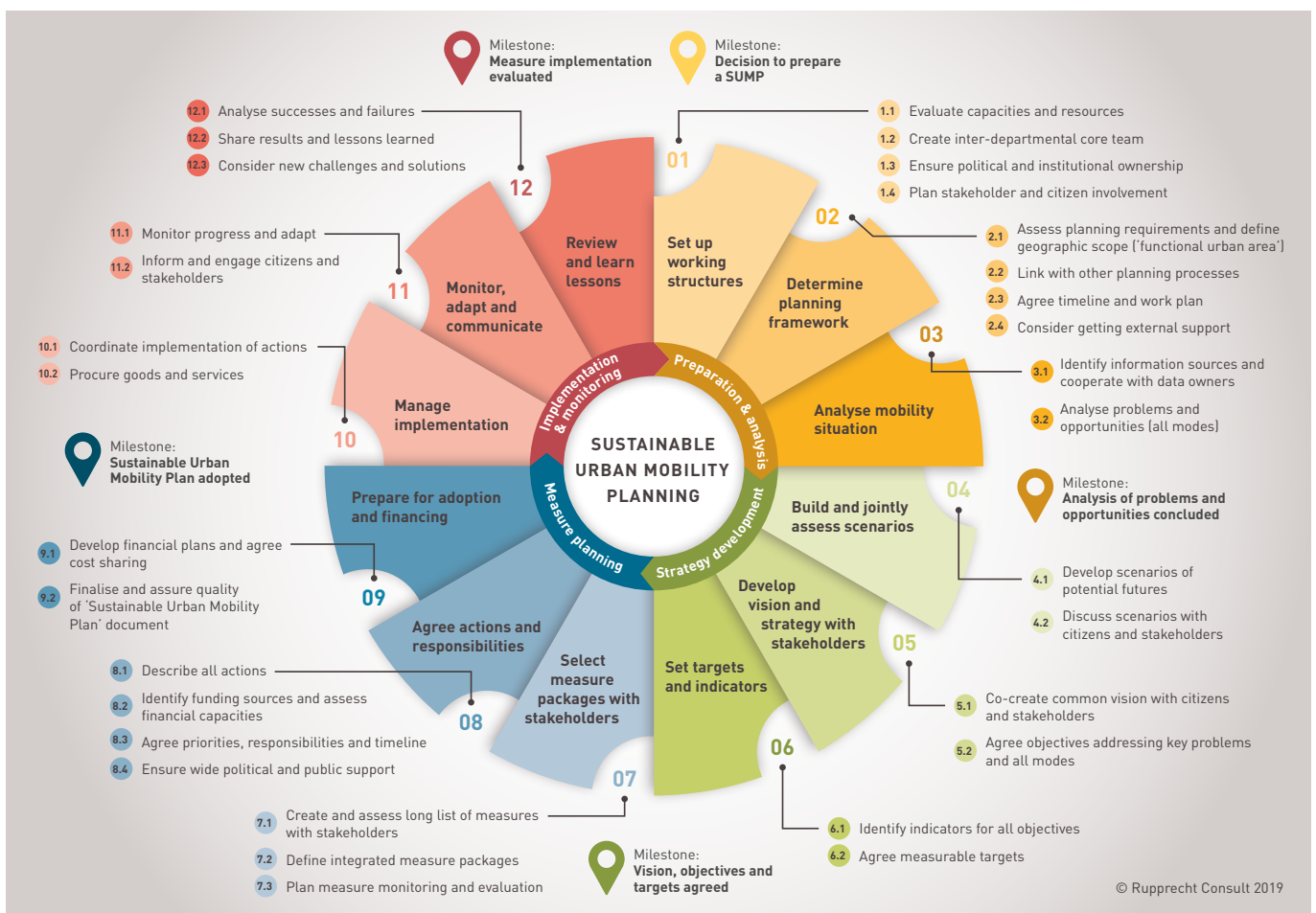
Figure 1: SUMP Planning Cycle 4

SUMP integrates eight crucial principles, in which citizen engagement, co-operation, integration and evaluation are key areas in a sustainable planning process (Figure 2). Each area needs to take into account the need for inclusiveness and the design of transport systems that meet the needs of all citizens – including the young, old, those from diverse ethnic and gender groups, those with disabilities or reduced mobility and from lower socio-economic groups. SIA enables the analysis of the effects that planned transport and mobility measures may have on different sectors of society, thus helping to ensure that the key SUMP principles of citizen engagement and inclusion are planned, implemented and evaluated.